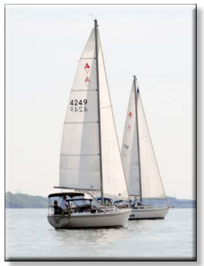
Gimlet and Steamboat sail across the bay.

SSC online calendar - In line with the website committee's efforts, there is going to be a concerted effort to keep the SSC online calendar current thus making it a more useful tool when you're trying to find out what is going on at your club. Go to <a href="SanduskySailingClub.com">SanduskySailingClub.com</a>, then to "Communities," then to "Events Calendar." Click on the event and you will receive more info, contacts, links, as well as any fliers available.