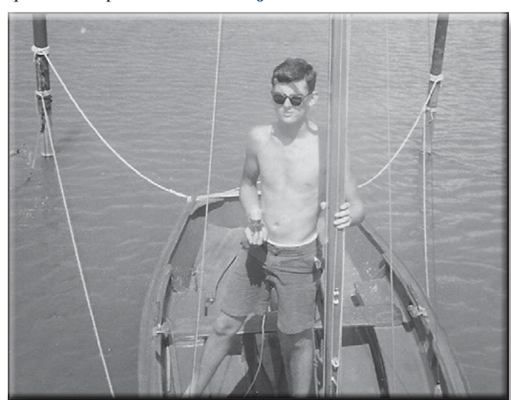
Who is this dashing young SSC sailor? See For the Good of the Order for the answer.