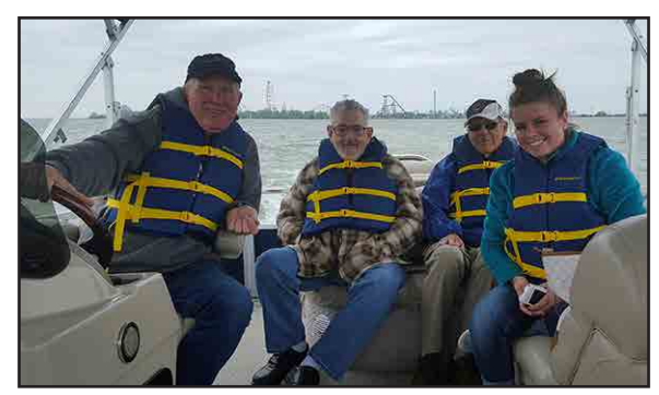
A group from the Adaptive Adventures Sailing program enjoy some time on the water.

Cleveland Race Week, Edgewater YC Knee Deep , Brett Langolf - 1st in Class