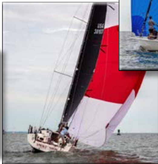
Left: Smoke Show wins single-handed class.