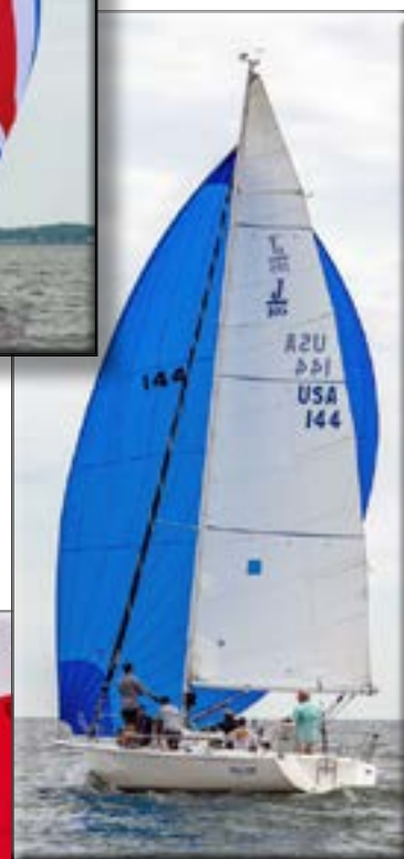
Far Left: True North at the start.