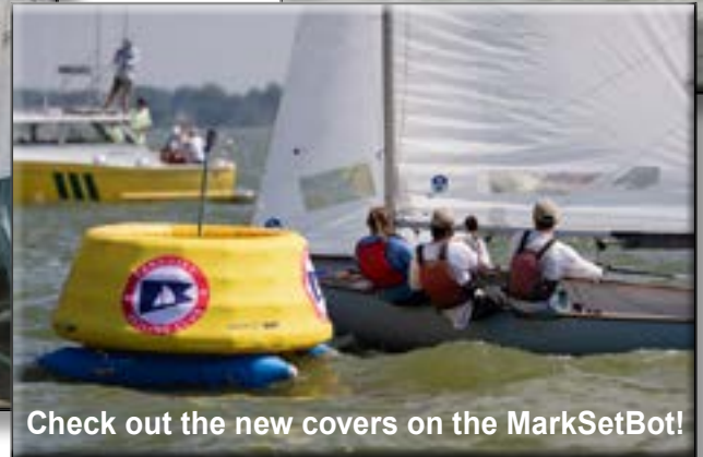
Check out the new covers on the MarkSetBot!