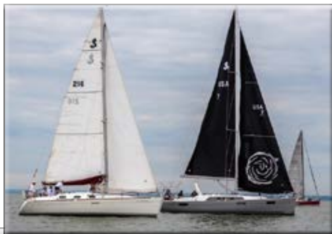
Above: Tumbleweed edges past Revelry at the start.