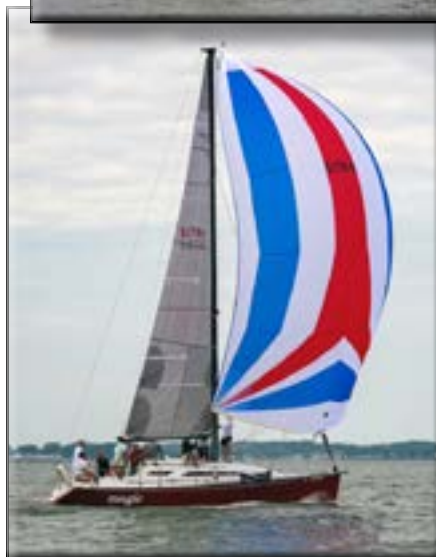
Above: Magic at the start.