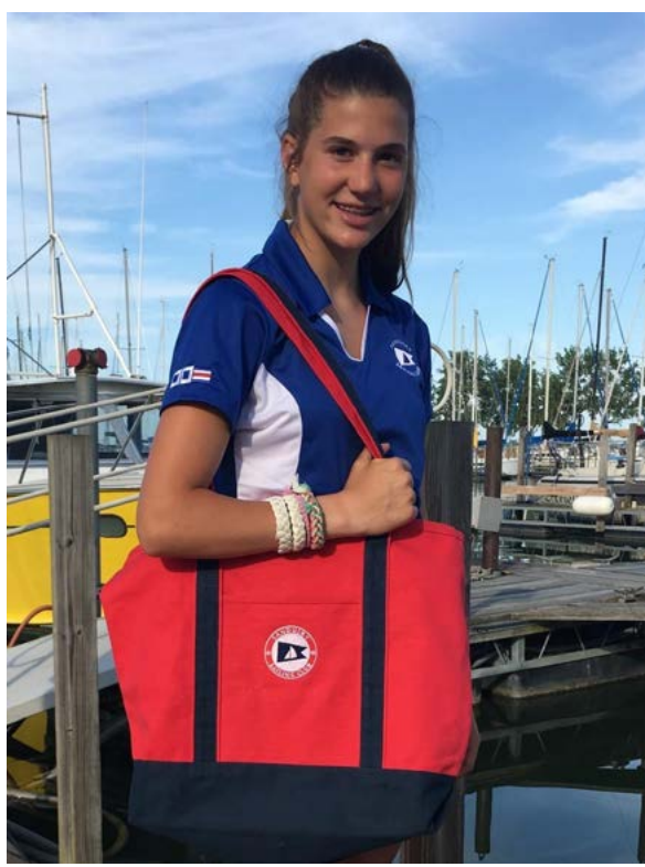
Lady's Sophisticated Polo – Gentle Contour Silhouette, Sharp White Detailing, Very Flattering!!! Cool 100% Polyester, Moisture Wicking SSC Logo on Left Chest, SSC Flags on Right Upper Arm