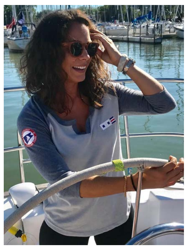
Women's Vintage T-Shirt – Extra Sporty, ¾ Length Sleeves Silver Body with Soft Navy Detail, Curved Shirttail Hem for Graceful Fit