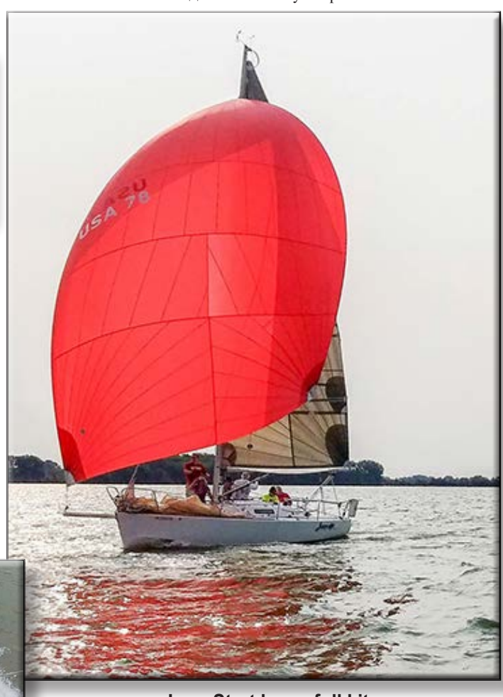
JumpStart has a full kite in the final Funday Sunday.

1987 Hunter 31. Excellent condition. Several sets of sails recently inspected and repaired. Yanmar 2GM20F 2 cyl. diesel. Sale includes steel cradle and many extras. Ready to cruise or race. Asking $25,000. Racing sails are available for extra $$. Contact Rory Carpenter at 734-660-1517.