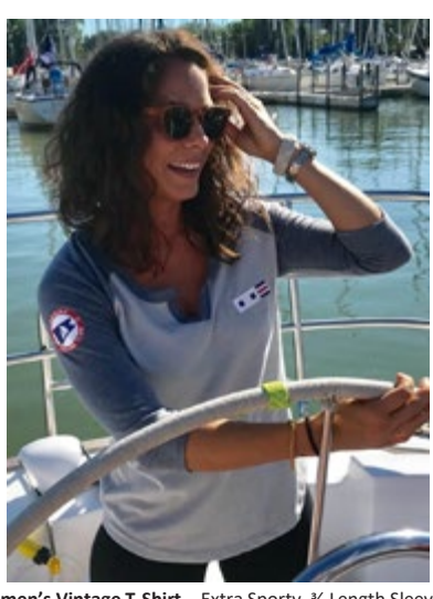
Women's Vintage T-Shirt - Extra Sporty, ¾ Length Sleeves Silver Body with Soft Navy Detail, Curved Shirttail Hem for Graceful Fit