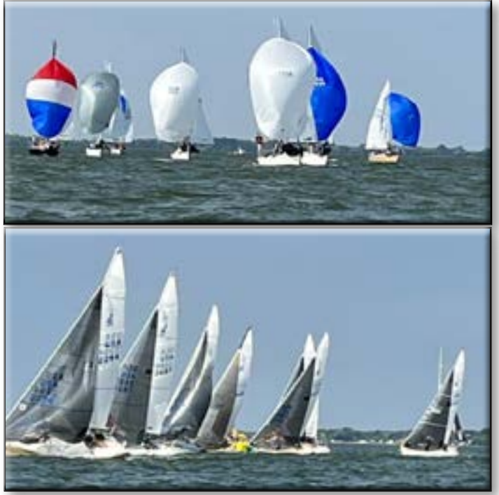
The J/24 class had a good turnout for its 2022 Great Lakes Championships at SSC. They had great wind and competitive sailing.

If you have any questions please feel free the contact me at <u>weatherlyboatworks@gmail.com</u>