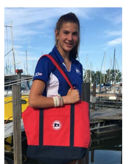
Lady's Sophisticated Polo - Gentle Contour Silhouette, Sharp White Detailing, Very Flattering!!! Cool 100% Polyester, Moisture Wicking SSC Logo on Left Chest, SSC Flags on Right Upper Arm Sizes: Small to X-Large Price: $32.50