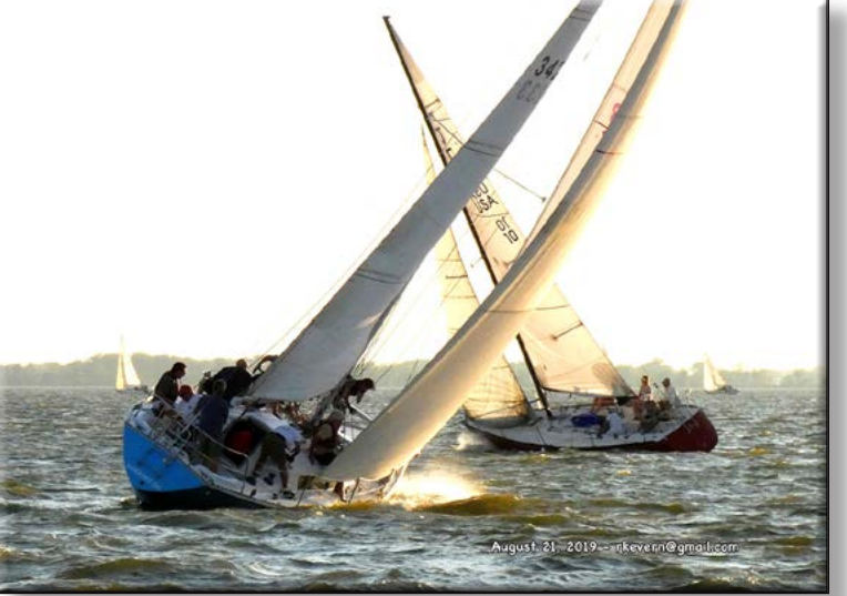
Hog Wild crosses ahead of Solitude on a Wednesday night race. Richard Kevern got some fantastic shots from the RC boat during the season.

New beers - We have added a variety new beers which have