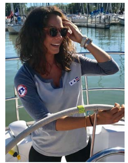
Women's Vintage T-Shirt - Extra Sporty, ¾ Length Sleeves Silver Body with Soft Navy Detail, Curved Shirttail Hem for Graceful Fit 50/50 Cotton/Polyester SSC Flags on Left Chest, SSC Logo on Right Upper Arm Sizes: Small to X-Large Price: $20.00