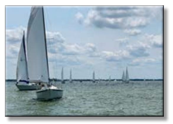
The Cruising Fleet heads out to check on the lighthouses. Several boats participated in the 2021 Lighthouse Inspection Tour.