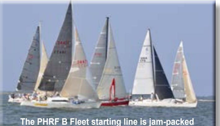
in the Islands Race/Leukemia Cup.

Here is a link to the photos that we received from the LLS Photographer, Dave Mathias, as well as other photos from the race. Make sure to run through them all...over 900 images! https://1drv.ms/u/s!AgbDYIhG59mn1S3M-EJugGTsIESu?e=bBIPwo