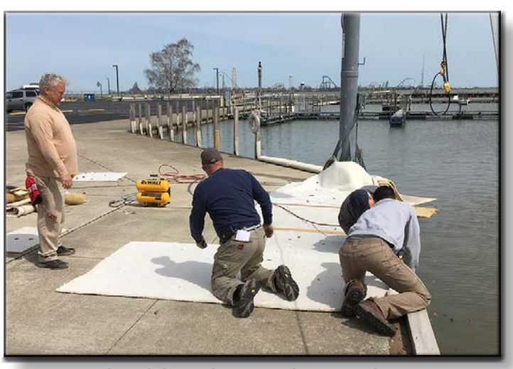
Interlakers dress up the carpeting at the hoist during Spring Workday.

If you want to contact me , feel free to reach me at Commodore@SanduskySailingClub.com or 419-706-5137.