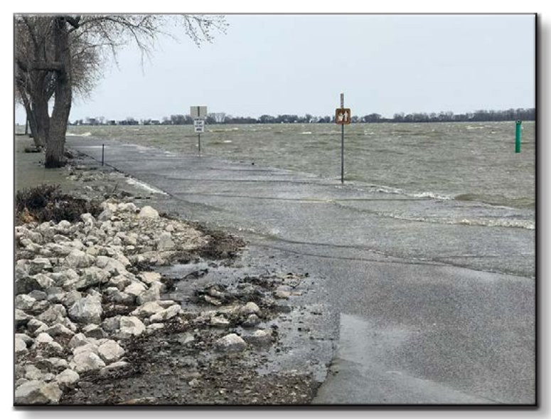
High water rolls right over the Washington St. pier.