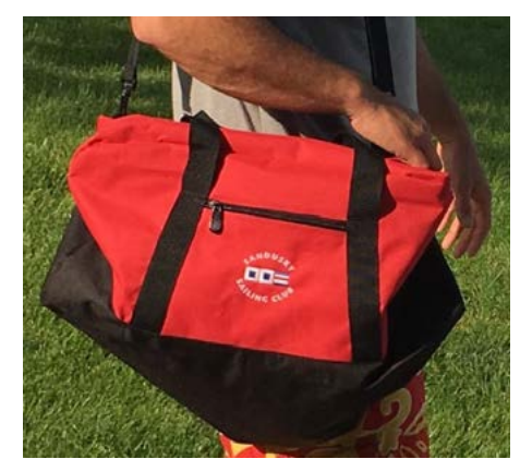
Duffle Bag - Heavy Duty Polyester with Adjustable Shoulde Strap, Top and Side Grip Handles, Front Zippered Pocket Red and Black with SSC Flags on Front Size: 22" x 11" x 10 1/2"