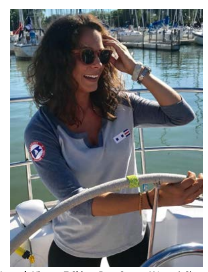
Women's Vintage T-Shirt – Extra Sporty, ¾ Length Sleeves Silver Body with Soft Navy Detail, Curved Shirttail Hem for