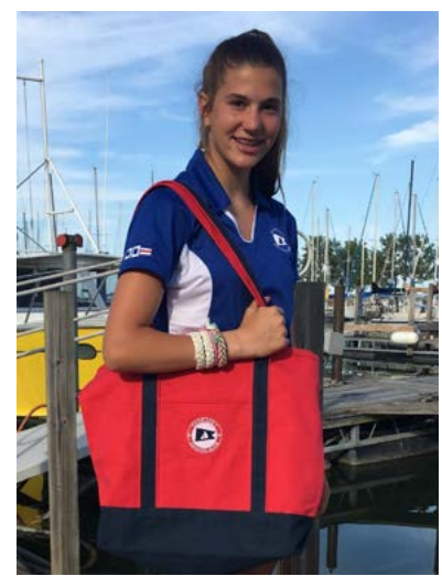
Lady's Sophisticated Polo - Gentle Contour Silhouette, Sharp White Detailing, Very Flattering!!! Cool 100% Polyester, Moisture Wicking SSC Logo on Left Chest, SSC Flags on Right Upper Arm Sizes: Small to X-Large