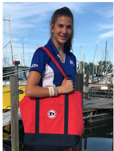
Lady's Sophisticated Polo - Gentle Contour Silhouette, Sharp White Detailing, Very Flattering!!! Cool 100% Polyester, Moisture Wicking SSC Logo on Left Chest, SSC Flags on Right Upper Arm Sizes: Small to X-Large