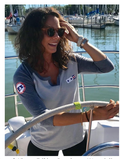
Women's Vintage T-Shirt - Extra Sporty, 3/4 Length Sleeves Silver Body with Soft Navy Detail. Curved Shirttail Hem for Graceful Fit