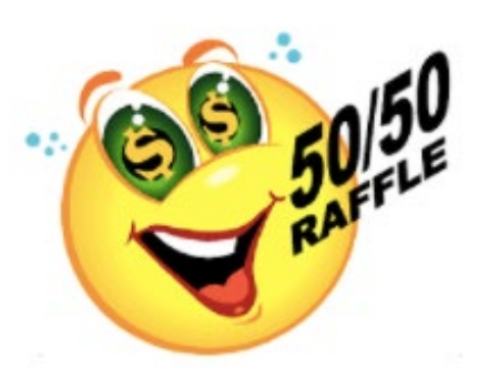
Join SJSI for the first N PERSON and VIRTUAL 50/50 Raffle!

Adult Start Sailing Classes are coming up! The four-day, evening class will be held Thursday, March 31, April 7, 21, and 28 from 6:30-8:30 pm. The full-day class will be held on Saturday, May 7, from 9am-5pm. If you are interested or know someone who is, please direct them to the sailsandusky.org website or then can call 419-871-8080.