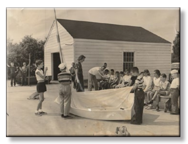
This photo was found in the old Junior sailing Clubhouse. Does anyone recognize the people in the photo? Not sure of the year.