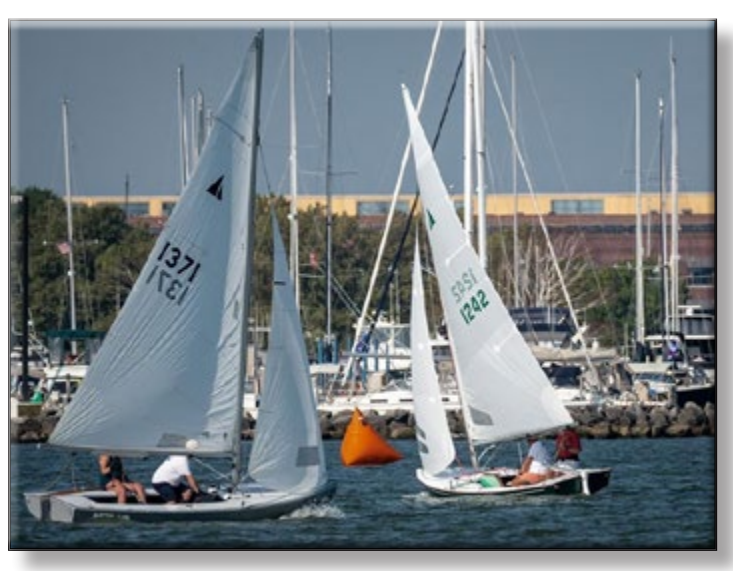
Excited for the season yet?!

I think this is a great time to leverage what the club offers to the city (Learn to Sail, significant regattas and commensurate income to the city from visitors, fundraisers which have a positive impact on local businesses, Adaptive Sailing, veterans' interaction and supporting their requests, Spring Break Simulator effort, iceboating, and being a good partner with the city). The time is now as we continue to emerge from 2020 to ensure our handprint is on the City of Sandusky. More to come on this.