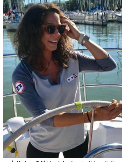
Women's Vintage T-Shirt – Extra Sporty, ¾ Length Sleeves Silver Body with Soft Navy Detail, Curved Shirttail Hem for Graceful Fit 50/50 Cotton/Polyester SSC Flags on Left Chest, SSC Logo on Right Upper Arm Sizes: Small to X-Large Price: $20.00