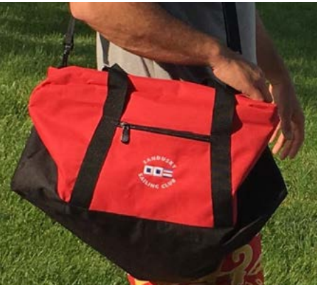
Duffle Bag – Heavy Duty Polyester with Adjustable Shoulder Strap, Top and Side Grip Handles, Front Zippered Pocket Red and Black with SSC Flags on Front Size: 22" x 11" x 10 ½" Price: $25.00