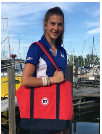
Lady's Sophisticated Polo – Gentle Contour Silhouette, Sharp White Detailing, Very Flattering!!! Cool 100% Polyester, Moisture Wicking SSC Logo on Left Chest, SSC Flags on Right Upper Arm Sizes: Small to X-Large Price; $32.50

After a drag race win from Key West to Sand Key, we continued on to Havana. Twenty-one of the fifty or so boats that started the Sand Key race continued on to Havana as well. Our strategy was to stay west of the rhumb line to Havana. Knowing that we would have to eventually deal with a two to three knot east current known as the Gulf Stream, we felt going west at least 8 to 10 miles of the rhumb line would help us when we started to get pushed east. Having poured over the NOAA maps showing us the general location of the stream, we determined that the bulk of the current would start about