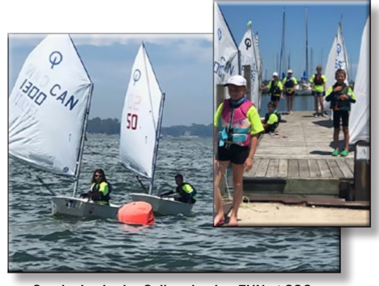
Sandusky Junior Sailors having FUN at SSC.