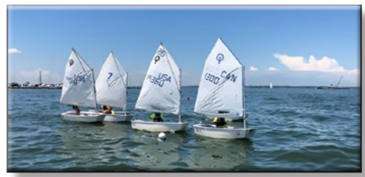
Sandusky Junior Sailors practice racing techniques on the bay in front of the club.

Website upgrades are done and we are working through an issue that has email blasts going only to the primary email address. Aside from the email issue, you will also notice it has a mobile version of the website that is very user friendly on your phone. If you have website issues, send an email to webmaster@sanduskysailingclub.com for assistance. You should also send announcements you want sent out to the membership to the same email address. The Club Calendar will be kept up to date with bar hours and the events that are sent to the webmaster to post, so if you don't see an event on the calendar, you know why.