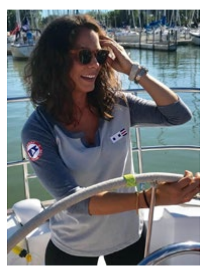
Women's Vintage T-Shirt – Extra Sporty, % Length Sleeves Silver Body with Soft Navy Detail, Curved Shirttail Hem for Graceful Fit 50/50 Cotton/Polyester SSC Flags on Left Chest, SSC Logo on Right Upper Arm