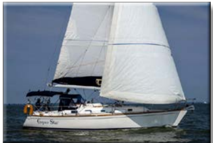
Gypsy Star sailing to Leamington

The Leamington Sail Away , by all reports, was well attended with several boats heading out from the club for a weekend in Canada.