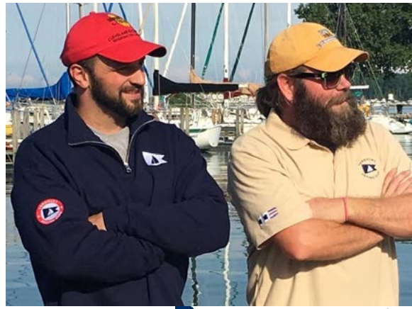
Unisex Quarter Zip Sweatshirt – Soft and Cuddly