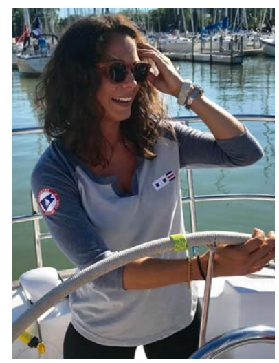
Women's Vintage T-Shirt – Extra Sporty, % Length Sleeves Silver Body with Soft Navy Detail, Curved Shirttail Hem for Graceful Fit

SSC Logo on Left Chest Sizes: Small to X-Large Price: $29.00