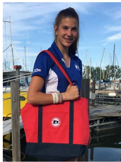
Lady's Sophisticated Polo – Gentle Contour Silhouette, Sharp White Detailing, Very Flattering!!! Cool 100% Polyester, Moisture Wicking SSC Logo on Left Chest, SSC Flags on Right Upper Arm