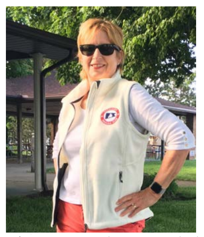
Women's Vest – Crisp Winter White, Front Zippered Pockets, Drawcords for Adjustable Hem Super Soft 100% Polyester

SSC Logo on Left Chest Sizes: Small to X-Large Price: $29.00