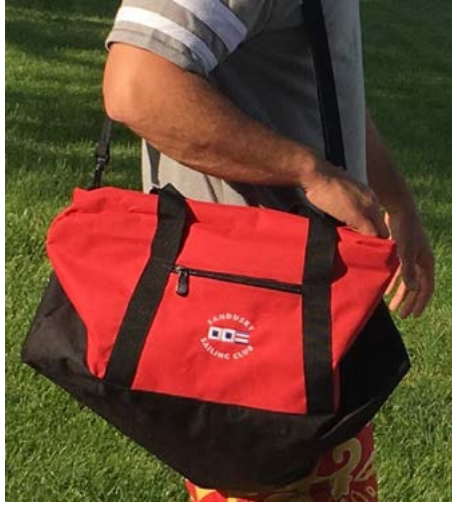
Duffle Bag – Heavy Duty Polyester with Adjustable Shoulder Strap, Top and Side Grip Handles, Front Zippered Pocket Red and Black with SSC Flags on Front