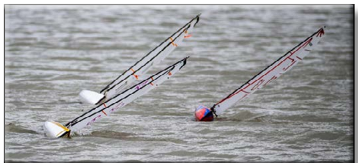
DF95s caught healthy breezes during Turkey Bowl

Inside SSC- A few smallish improvements, as compared to last year, will occur within the clubhouse. The schedule for improvements is fluid at this time with updates in the near future. The clubhouse will continue to be available for rental so plan ahead; we suggest that your dates be flexible.