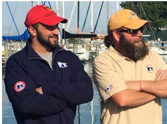
Unisex Quarter Zip Sweatshirt - Soft and Cuddly 50/50 Cotton/Polyester, Won't Shrink

SSC Burgee on Left Chest, SSC Logo on Right Upper Arm