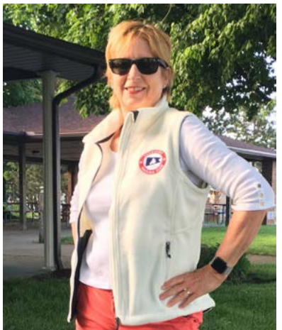
Women's Vest – Crisp Winter White, Front Zippered Pocke Drawcords for Adjustable Hem Super Soft 100% Polyester

SSC Logo on Left Chest Sizes: Small to X-Large Price: $29.00