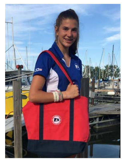
Lady's Sophisticated Polo – Gentle Contour Silhouette, Sharp White Detailing, Very Flattering!!! Cool 100% Polyester, Moisture Wicking SSC Logo on Left Chest, SSC Flags on Right Upper Arm