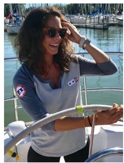
Women's Vintage T-Shirt – Extra Sporty, ¾ Length Sleeves Silver Body with Soft Navy Detail, Curved Shirttail Hem for Graceful Fit

SSC Logo on Left Chest Sizes: Small to X-Large Price: $29.00