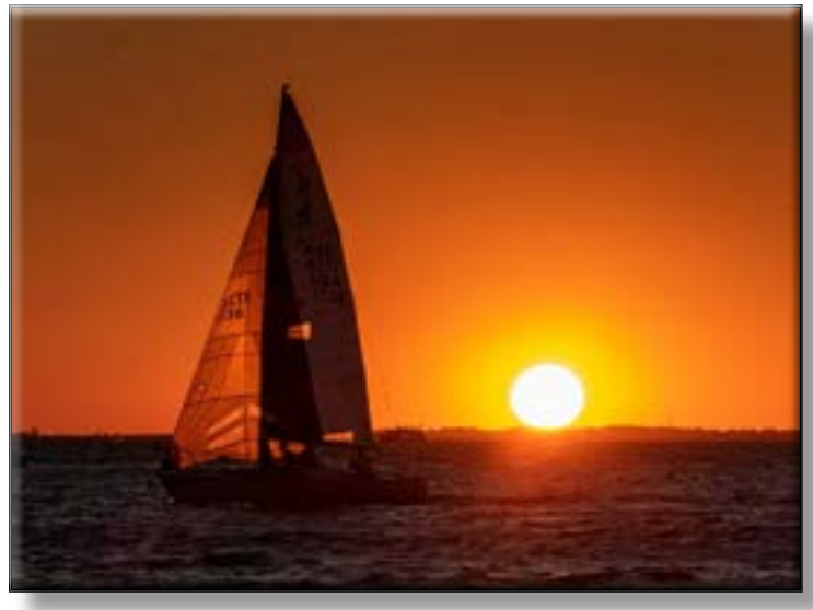
A J/24 sails off into the sunset on a Wednesday night.

previous month. Call/text 614-940-1565 or email me at ViceCommodore@SanduskySailingClub.com.