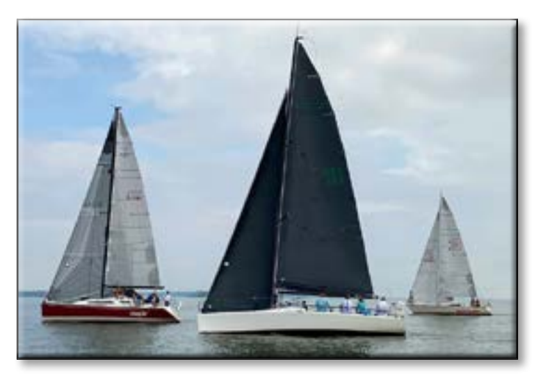
A few SSC sailboats head to the first mark during the PC Norm Winkel Great Sailboat Race at SYC.

I would like to thank all the volunteers for the continued care of the club. From trash cans being emptied, to dispensers being filled, to towels being washed and returned, your efforts do not go unnoticed.