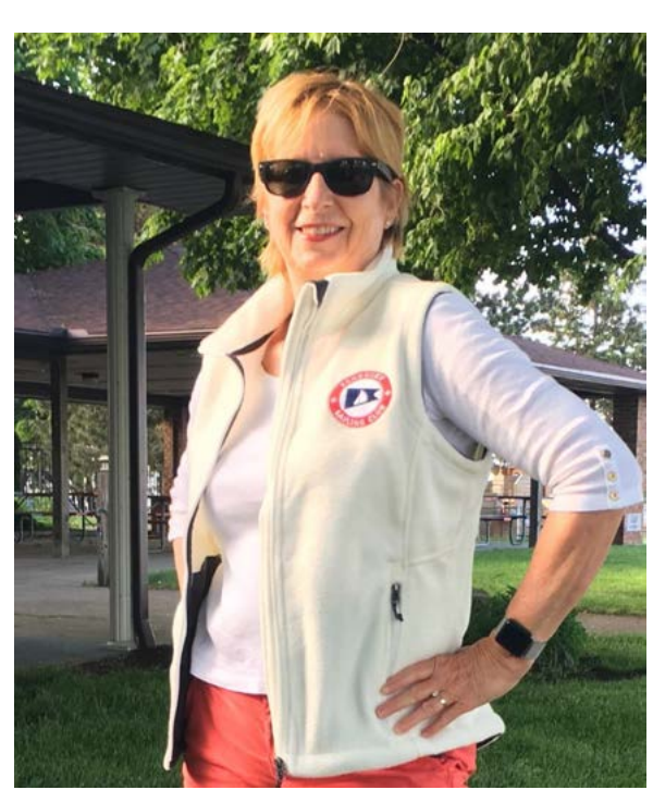
Women's Vest – Crisp Winter White, Front Zippered Pockets, Drawcords for Adjustable Hem Super Soft 100% Polyester SSC Logo on Left Chest Sizes: Small to X-Large