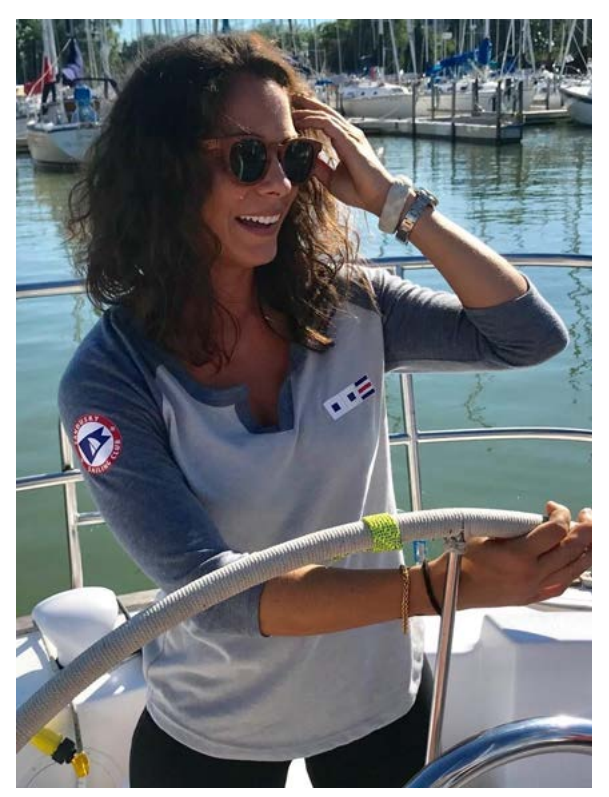
Women's Vintage T-Shirt – Extra Sporty, ¾ Length Sleeves Silver Body with Soft Navy Detail, Curved Shirttail Hem for Graceful Fit