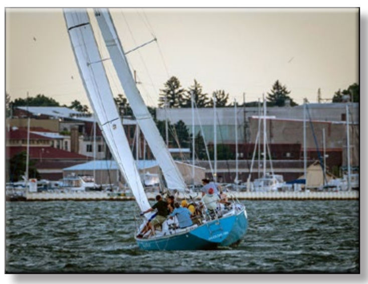
How about now? Ready to sail?

Additionally, over the past several years, we have been in touch with members of the Steering Committee regarding the direction of the City in terms of investment and strategy.