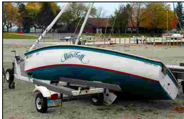
Oh, the irony in a name. High winds in late October knocked Windfall off her trailer.

Please contact me with any questions or concerns about the clubhouse or basin at timmo@sbcglobal.net .