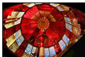
View inside the lighthouse.

1980 Chrysler (Morgan) Super 27 is a racer/cruiser. PHRF-LE rating = 159, JAM = 169. Meticulously maintained and upgraded. Completely restored to "better than new" condition with AWLGRIP topsides and deck, mast, boom and spinnaker pole. Lots of sails, lines, instruments and gear included. Asking $23,500. Located at SSC berth A9. Contact Jim Shufflin at 419-370-9053 or james.shufflin@kbibearing.com