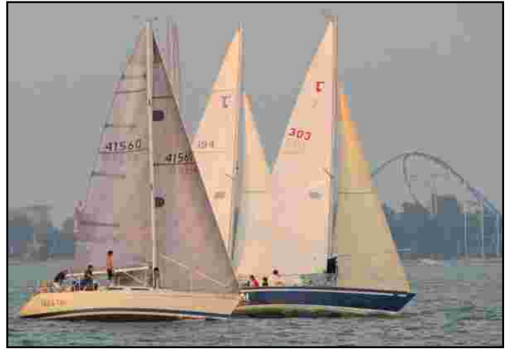
Tight Wednesday night action.

Race Committee / Sunday Racers Season Wrap Up Potluck -Sunday, Sept. 22 following the morning races. Race Committee members and racers are invited to join in a potluck brunch to wrap up the season. Bring a dish and your best racing tales to share. Contact Joyce Keane with questions 419-433-2648