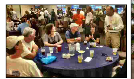
Crews review the races at the party.